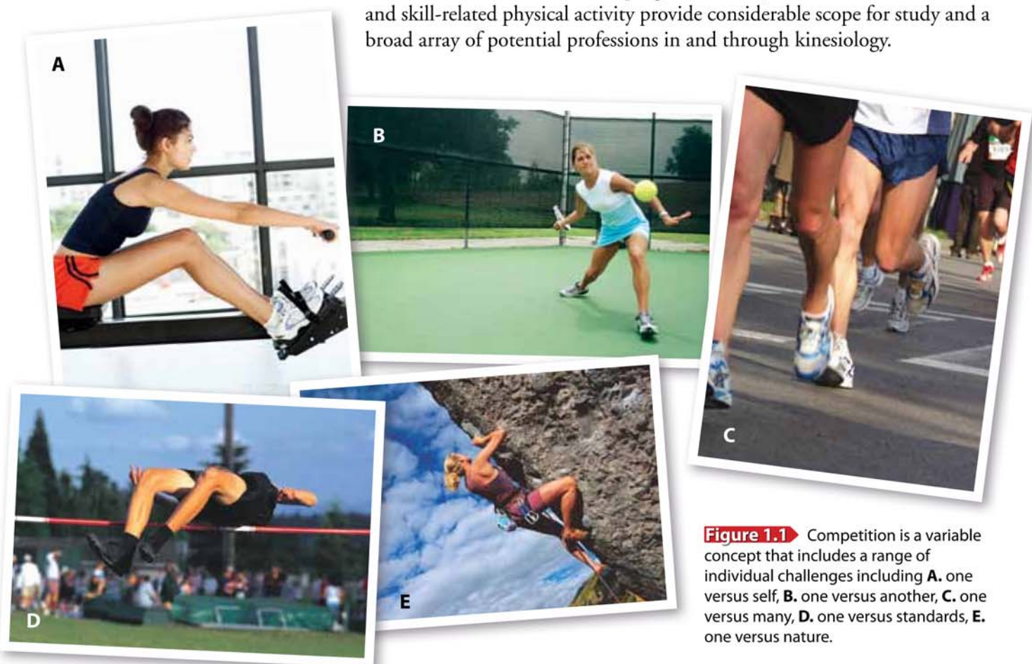
Figure 1.1 Competition is a variable concept that includes a range of individual challenges including A. one versus self, B. one versus another, C. one versus many, D. one versus standards, E. one versus nature.

When combined into one program of study, health-related movement and skill-related physical activity provide considerable scope for study and a broad array of potential professions in and through kinesiology.