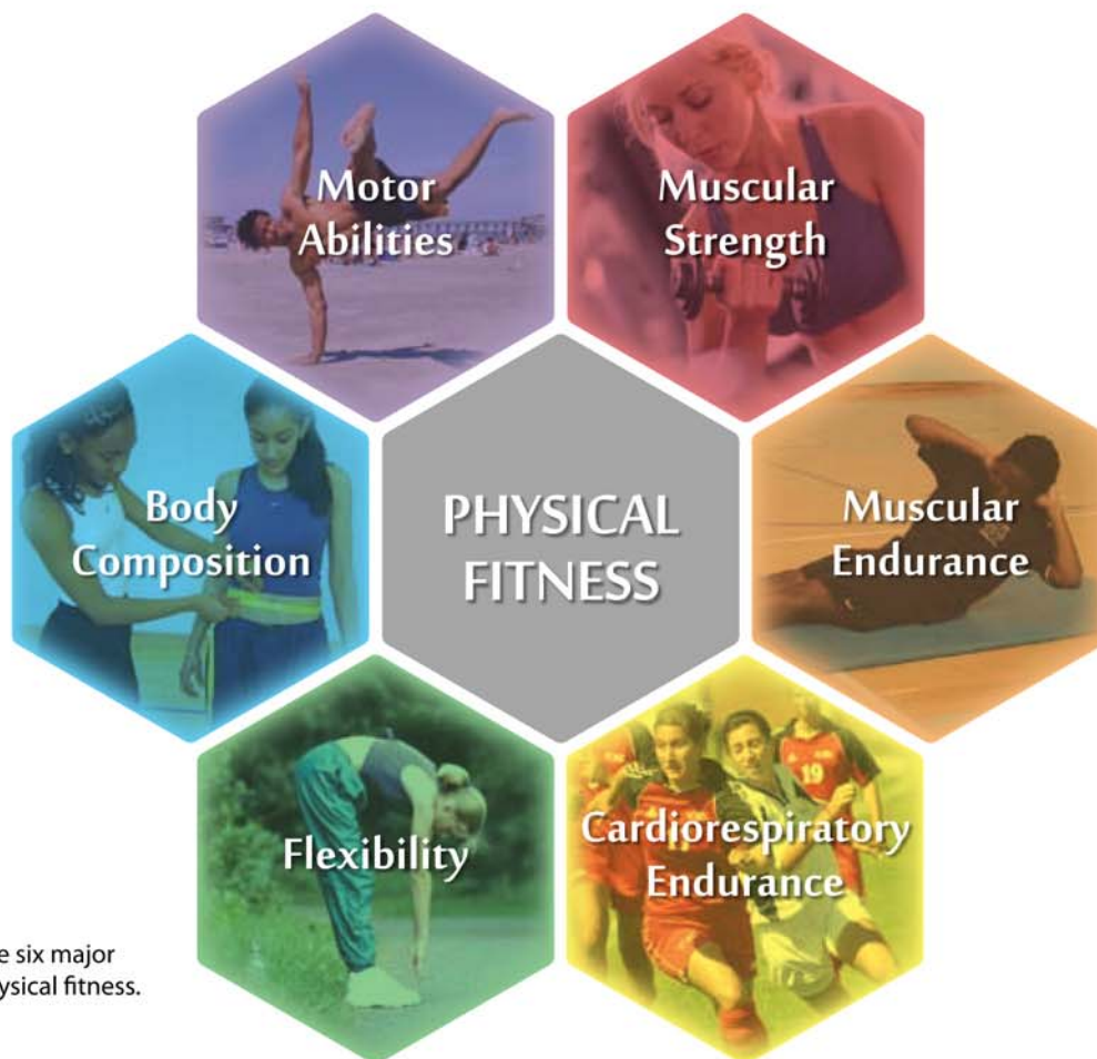
Figure 15.1 The six major components of physical fitness.

Physical fitness incorporates various components important for general health that are essential for people of all ages and abilities (Figure 15.1). These components – muscular strength, muscular endurance, cardiorespiratory endurance, flexibility, and body composition – were examined in previous chapters, but they will be discussed in this section as they relate to achieving health-related fitness .